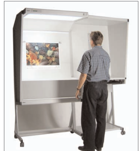
VPI/SP with top and bottom illumination and monitor holder