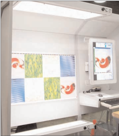
Accommodates monitor, hard proof, keyboard, top and bottom illumination

We offer a complete selection of soft proofing systems for tabletop to press console applications.