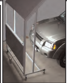
Castors included for positioning

The GTI® inspection system for the automotive industry includes Hi-Rendition Daylight (D65) for color evaluation of exterior coating and accessories, and was designed for "Color Harmony Audits."