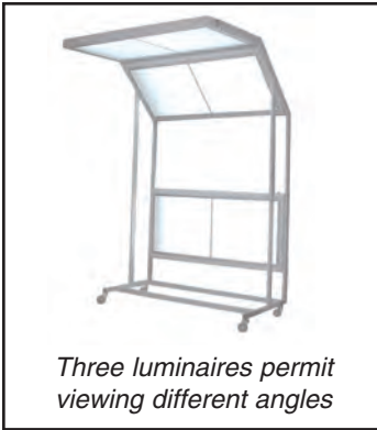
Three luminaires permit viewing different angles

Color inspection system designed for the automotive industry