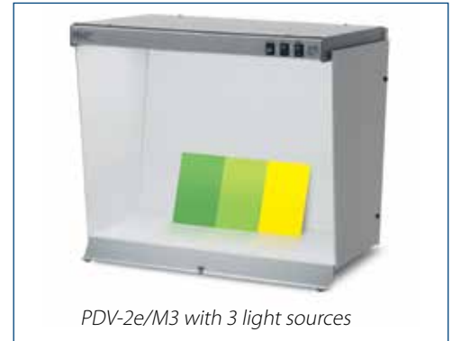
PDV-2e/M3 with 3 light sources