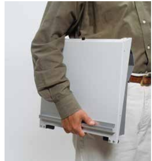
Both PDV-2e/M models feature a hinged design for quick set-up, easy pack-up, portability and storage.